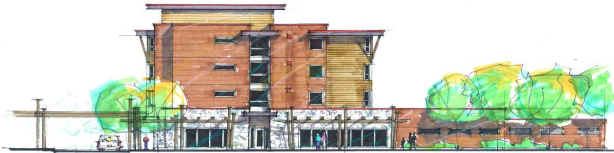
Allenby Road (west) Elevation

All work is designed to meet or exceed the INAC Standards as defined in the INAC Codes Standards and Guidelines